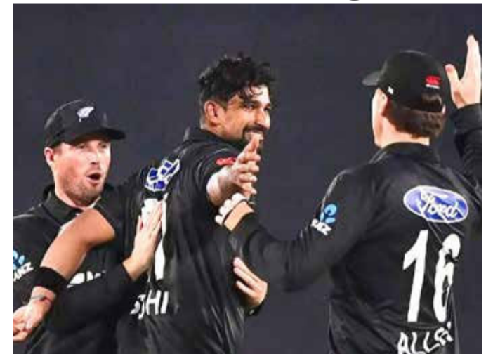
New Zealand's Ish Sodhi (C) celebrates with teammates after taking a wicket (file photo)