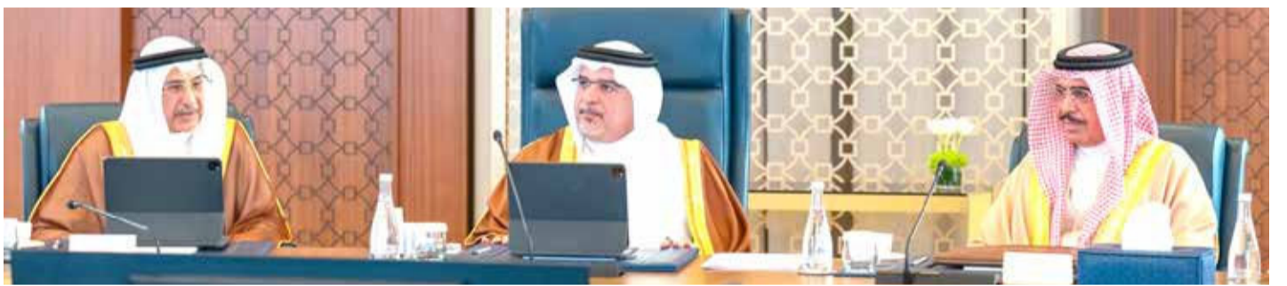
HRH the Deputy King chairs the weekly Cabinet meeting

The Cabinet praised the initiatives announced by the President of the UAE, His Highness Shaikh Mohamed bin Zayed Al Nahyan, in his speech at COP28, which includes the establishment of a $30 billion fund for climate solutions worldwide, the UAE's investment of $100 billion in financing climate action,