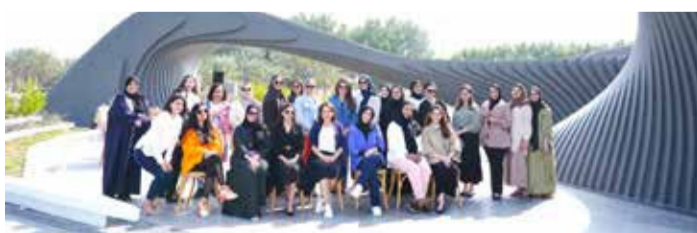
Power of Pearls

ing them to contribute to the progress and prosperity of the Kingdom across all sectors.