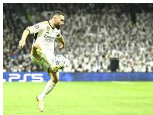
Dani Carvajal in action

BRAVE CF has organized 80 events in 30 nations, featuring nearly 800 athletes from over 80 countries across the globe.