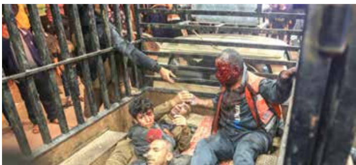
Palestinians wounded during Israeli bombardment arrive at Nasser hospital in Khan Yunis in the southern Gaza Strip yesterday.

Weeks after Israel deployed ground forces in the north of the Gaza Strip, the army has been air-dropping leaflets in parts of the south, telling Palestinians to