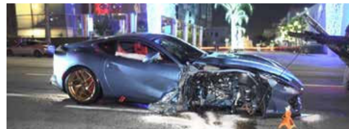
Michael B. Jordan's Ferrari after the crash

The 'Creed' actor, 36, ploughed the supercar into a Kia in Hollywood, California, around 11.30pm on Saturday night, with pictures taken at the scene that are being run by TMZ showing the right side of the electric blue vehicle severely smashed - with its airbags deployed and a wheel with gold