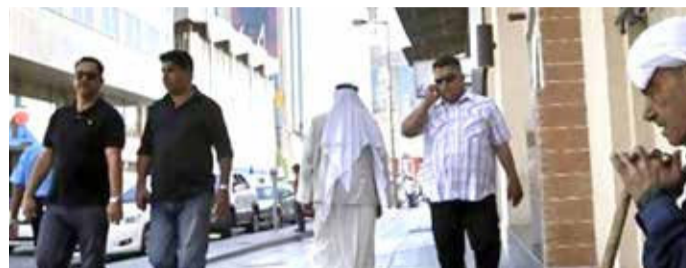
Bahraini citizens deserve a better quality of life

The findings of the report will be discussed, and parliamentarians will propose potential measures to address the underlying causes of the decline in quality of life. Recognising the importance of transparency and accountability, the parliament aims to engage in open dialogue and inclusive discussions.