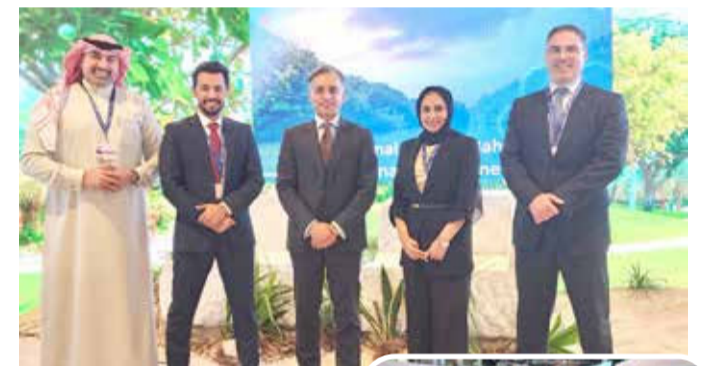
NBB delegates at COP28