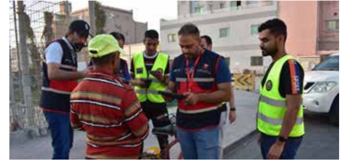
An expat's status is being checked by an LMRA inspection team