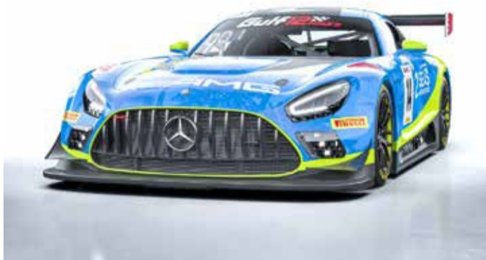
2 Seas' #14 Mercedes AMG-GT3 challenger to compete in the race's Pro class

Cars from Audi, BMW, Ferrari, McLaren, Mercedes-AMG and Porsche are represented on the official entry list. 2 Seas have