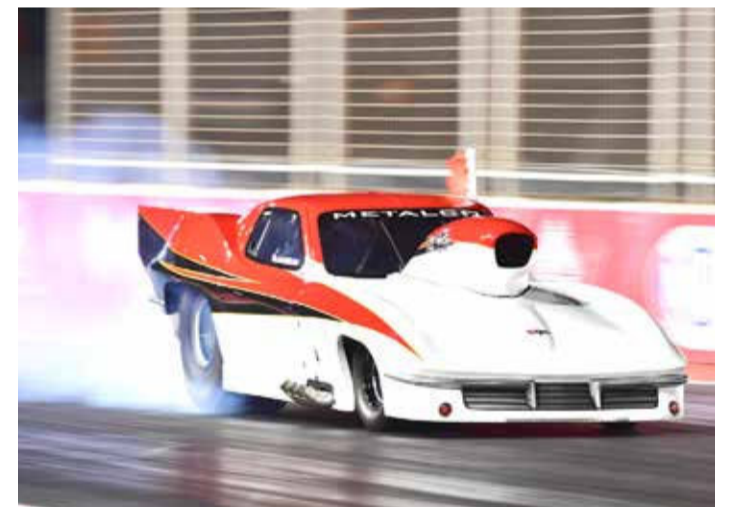
Action from a previous event at BIC (file photo)

Round three will then be held from 30 January to 2 February, and then round four will be the following week from 6 to 9 February. The championship finale will then take place 19 to 22 March at BIC.