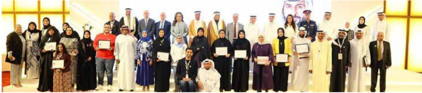
RHF officials with the winners of the "Hekayati" competition