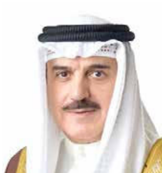
Speaker Al Musallam

A Bahrain delegation, led by Shura Council Chairman, His Excellency Ali bin Saleh Al Saleh, and Council of Representatives Speaker, H.E. Ahmed bin Salman Al Musallam, will participate in the international Parliamentary Meeting, set to take place tomorrow at Expo City Dubai.