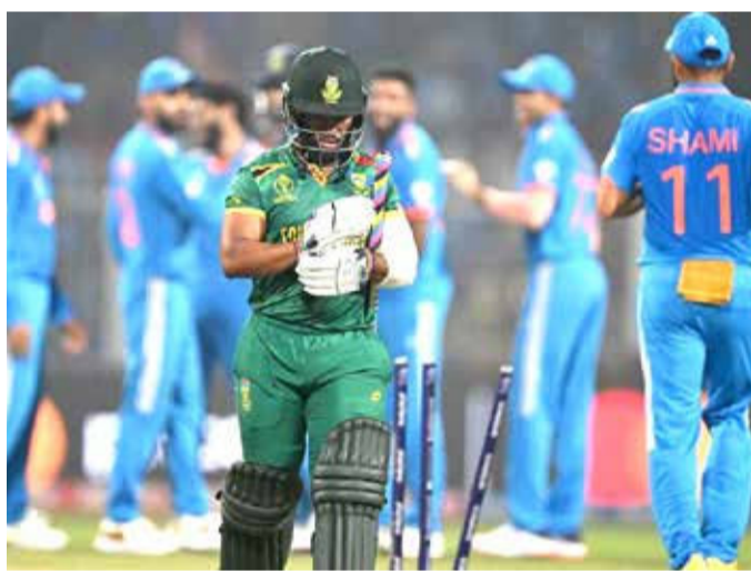
South Africa's captain Temba Bavuma (C) walks back to the pavilion after his dismissal during the World Cup match against India (file photo)