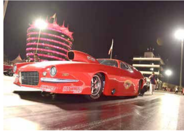
A drag racer in action at BIC (file photo)

The BDRC season is being organised and run by BIC in cooperation with the Bahrain Motor Federation, the Bahrain Drag Racing Commission and