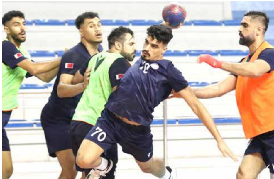
Bahrain national team players in a scrimmage during training

Prior to their French trip, the Bahrainis are also set to play Iraq and Morocco in a pair of international friendly games at